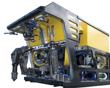
Applications: ROV/AUV, Diver